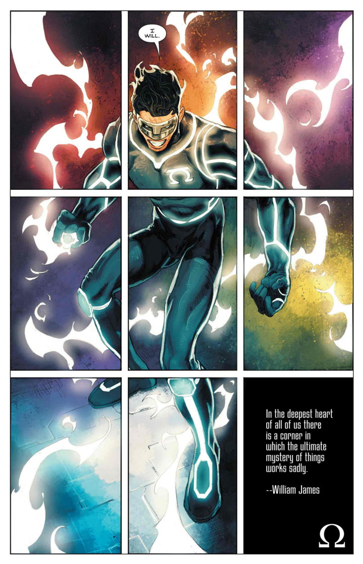
Figure 2: The Omega Men #9, Peace for Vega, Tom King, Barnaby Bagenda, and Romulo Fajardo Jr., © DC Comics a Warner Bros. Entertainment Company, 2015.

colours of orange, yellow, red, pink, indigo, blue, green, through to black and white (2015; Figure 2 ), which are presented in the visual images of the comic book panels as a powerful but less direct counterpoint to the words that we read. This device is also used in the comic to draw attention to the difference between what people say they believe and how these beliefs go on to inform the ways in which characters act.