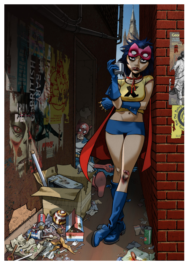
Jamie Hewlett design for Comics Unmasked at the British Library © Jamie Hewlett 2014.

Keywords: British Library; libraries; comics; comic books; UK; Comics Unmasked; exhibition; art