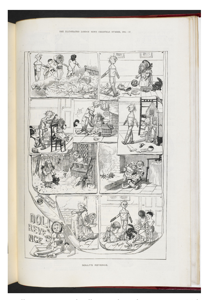
"Dolly's Revenge". The Illustrated London News .

AE: There's some fascinating stuff. There's so many things that are exciting about this, but some of the 19th century comics that we found, such as the ones in The Graphic and The Illustrated London News , you actually have places where, in the Christmas issues, members of the public could write in and send sketches of things, stories that happened to them. And the in-house artists would draw them up as comics. You actually get, from the 1880's, a glimpse of what a young woman on a ship going across the Atlantic felt about being pursued by various gentlemen, because she expressed this in these