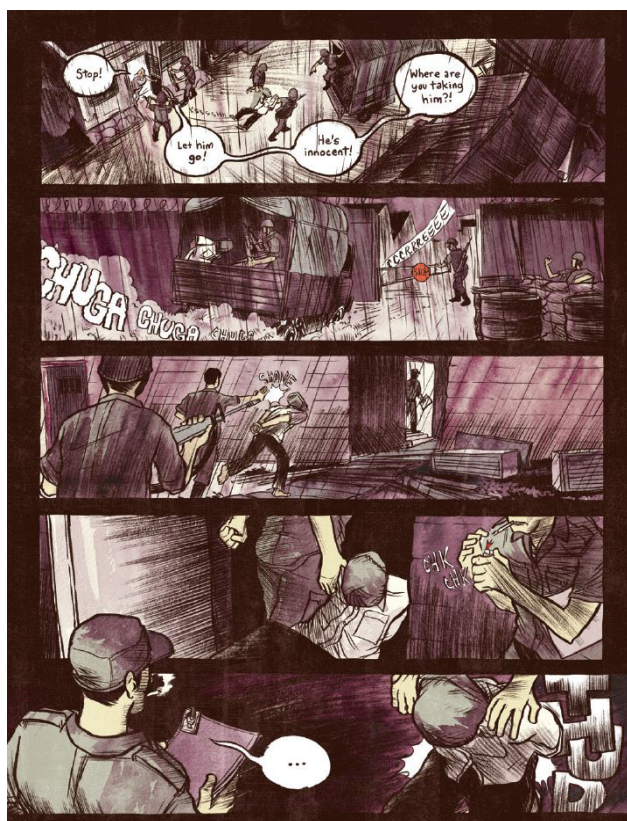
Figure 1: Tran, GB (2011) Vietnamerica (London: Villard, 69).

The mind's protective shield is not engaged in time; the threat to the self is recognised one moment too late. If trauma exists separately from comprehension, then it has never been known fully or, indeed, understood and has therefore not existed in time. It is this lack of temporal understanding and direct experience that causes the traumatic rupture and leads to the development of traumatic symptoms. I reiterate my initial point: time – and the fracturing thereof – has an effect on all other symptoms of the traumatic rupture; it is this rupturing of time that we see in the representation of Tri's story in Vietnamerica .