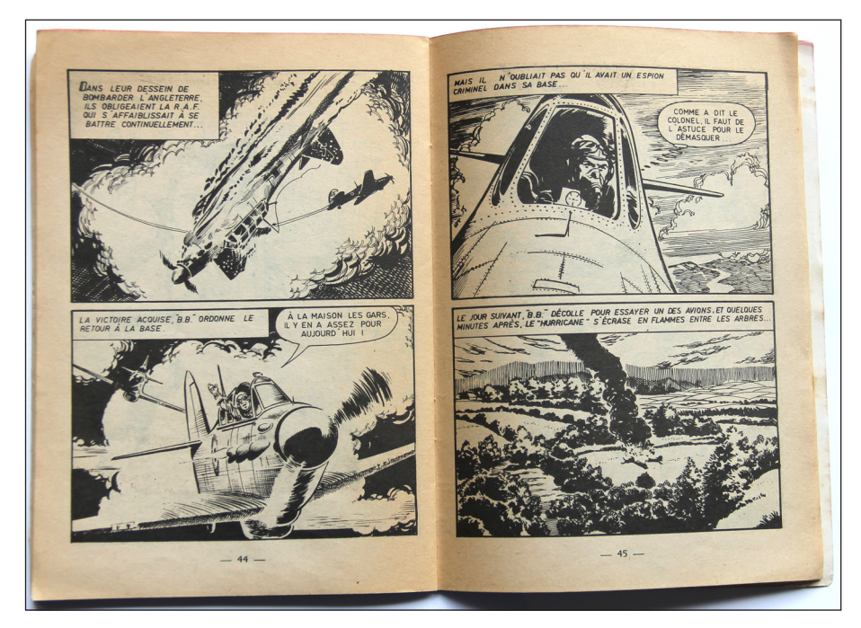
Figure 4: Author unknown. Battler Britton , no. 178 (Lyon: Imperia, 1967: 44–45). © Imperia, 1967.