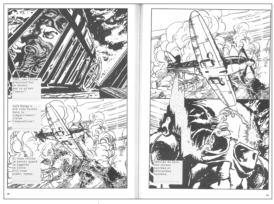
Figure 3: Ristorcelli, J. Les Écrans . (Montreuil: Matière, 2014: 28–29).