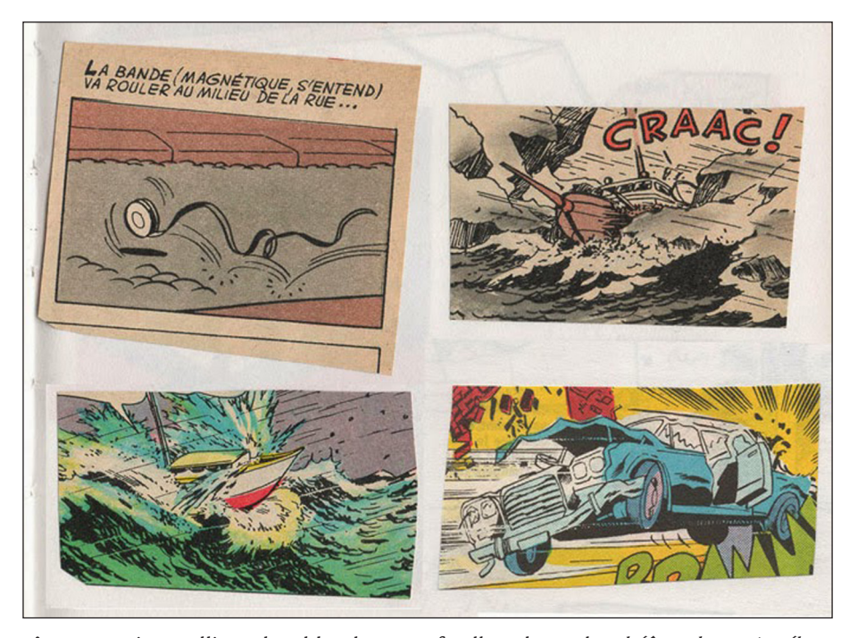
Figure 2: Ristorcelli, J., sketchbook page of collaged panels, Théâtre de papier élect-rique , 16 September 2014 [Accessed 9 November 2015].

etcetera). These petits formats epitomize the mass industrialized comics production: Massively produced in the 1960s and 1970s, these petits formats . . . : publishers would buy microfilms mostly from American and Italian comics publishers or syndicates, and have their cartoonists and artisans anonymously reassemble the material. The process involved writing the dialogues, cutting 'sensitive' panels or elements liable to censorship, redrawing the backgrounds, and so on. Despite their enormous proliferation, these petits formats are relegated to a footnote in histories of comics, which privilege the adult comics of the 60s and 70s, often inscribing the past into national comics traditions where the petits formats emerged out of transnational exchanges.¹ Ristorcelli's collage undoubtedly reads as an homage to this forgotten production. Like scrapbooks were meant to preserve preferred comics images, Les Écrans combines these 'visual possessions' into a long sequence that mimics the aesthetics of the petits formats – realistic drawing style, strong black and white contrasts, grey zip-atone – only reanimating their collected fragments into another context ( Figure 3 ).