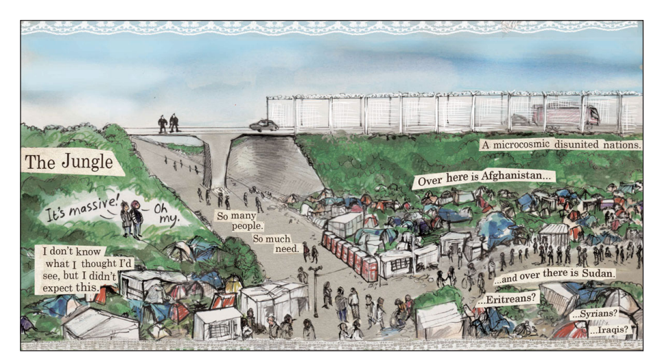
Figure 1: Excerpt from Evans, Kate (2017) Threads: From the Refugee Crisis (London & New York: Verso) © Kate Evans.

is recognisably human. With film, you have to alter someone's voice or black out the face which depersonalises the story teller. With comics, you can simply select another face and draw them differently.