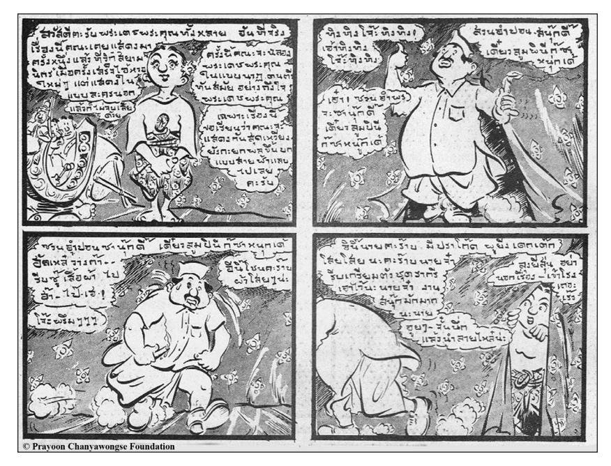
Figure 4: Inaugural strip of the Cartoon Likay adaptation of Honwichai Kawi by Thai cartoonist Prayoon Chanyawongse, published in the newspaper PimThai in 1950. Reproduced from the collection of Honwichai Kawi (Chanyawongse 1985: 2). © Prayoon Chanyawongse Foundation.

Serialized in the newspaper Pim'Thai in 1950 and 1951 (Tanapollerd 1979: 192), the Honwichai Kawi comics narrative falls into the Cartoon Likay genre, incorporating the following elements: a piphat orchestra in the first panel, the introduction of the Likay play by troupe manager Sooklek, the ok khaek introductory opening ( Figure 4 ), the constant shift from presentational and representational acting, the aesthetic of interruption, and the use of Bot Rong Likay [ Likay lyrics] and versification (Wechanukhroh 1990). Sixteenth long-form comics of Prayoon Chanyawongse, Honwichai Kawi merges the Suakho Khamchan dramatic poem composed during the second part of the seventeenth century (Bee, Brown, Chitkasem and Herbert 1989; Jumsai 2000) with a later version written by King Rama II [r. 1809–1824] as a Lakhon dance drama under the title Honwichai Kawi . The tale recounts the friendship between an orphan tiger cub named Honwichai and an orphan calf named Kawi.