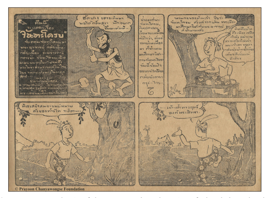
Figure 1: Inaugural strip of the Cartoon Likay adaptation of Chanthakorop by Thai cartoonist Prayoon Chanyawongse, published in late 1938 in the newspaper Suphapburut. Reproduced from the 1940 collection Katun Likay Rueang Chanthakorop Phak 1 , Samnak Ngan Nai Metta, Bangkok. Illustration provided to the author by Soodrak Chanyavongs. © Prayoon Chanyawongse Foundation.

The inaugural strip (reproduced in Tanapollerd 1979: 83) is composed of two tiers. In the first panel, the ok khaek is performed next to an introductory caption ( Figure 1 ). The khaek swirls on stage while addressing his lines towards the reader, and the still invisible intradiegetic audience. Only later in the graphic narrative will the intradiegetic audience be shown; a group of mae yok are portrayed crying over the fate of Chanthakorop (Chanyavongs 2016, personal communication). In the third panel, the character of Sooklek appears, sitting on a bench in front of a tree. Sooklek, who will later become Prayoon Chanyawongse's popular and recurring alter-ego in his cartoon production, is introduced in Chanthakorop as the leader of the Likay troupe (Tanapollerd 1979: 190). With his lips and eyelashes apparently accentuated with make-up and wearing a Likay costume and a headband with feather, he introduces the play as an intradiegetic narrator, facing reader and audience. Shifting from presentational address to representational acting, Sooklek leaves his bench in the second tier and walks in a naturalistic rural landscape far too vast to fit on a