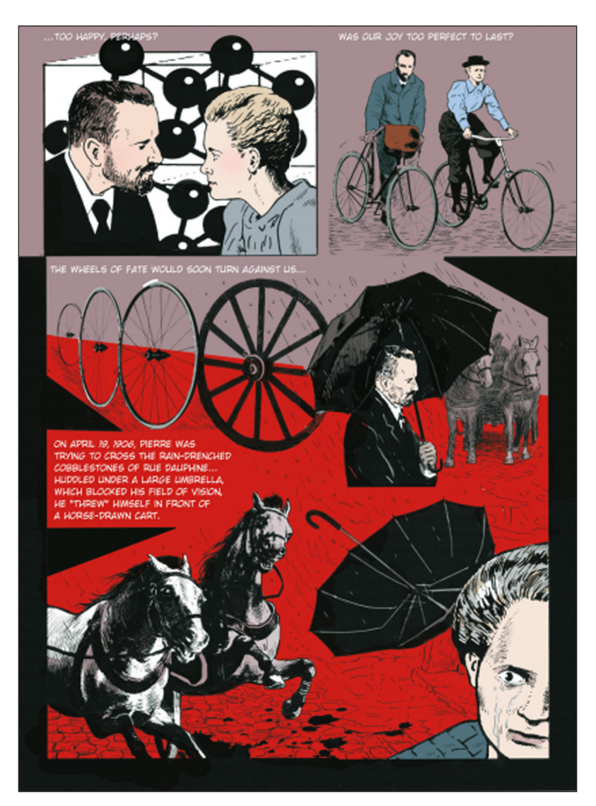
Figure 1: Marie Recalls Pierre's Death in The Radium Fairy by Chantal Montellier and Renaud Huynh, 2016: 15. © 2016 DUPUIS – Chantal Montellier & Renaud Huynh.

Montellier's irregular layout, large red splash, and repetition of the oncoming wheels and horses constructs a violent, surrealist nightmare while Redniss's large scale cityscape and distorted human and animal bodies create an expressionistic, folkloric hallucination.