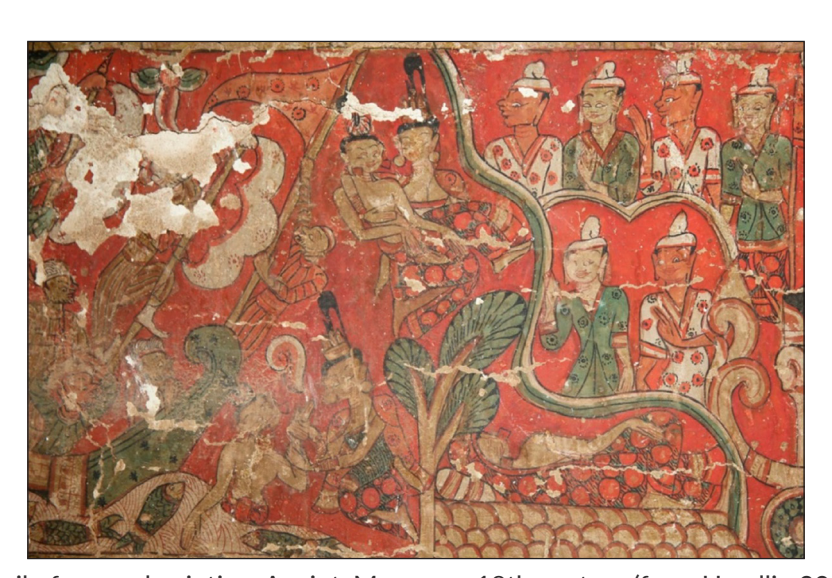
Figure 2: Detail of a mural painting, Anaint, Myanmar, 18th century (from Handlin 2020: Figure 7). © 2020 Lilian Handlin under Creative Commons Attribution CC BY 4.0.

The style of Pagan's wall paintings evolved over 150 years, but the main stylistic features are as follows. Up until the second half of eighteenth century, linear perspective is not used but depth is suggested through overlapping figures, or through figures placed at a higher position to suggest distance (Ranard 2009:6). 'Mind perspective' is applied with characters of higher importance being depicted with larger bodies. Scenes and actions are separated in cells by wavy line dividers. They stem from the kanut feature of Burmese painting, a "decorative art for curving designs of flowers and vegetation, geometric arabesque, [and] elaborate abstract flourishes" (ibid., p. 11). Stylized two-dimensional figures are drawn with flat colours and a bold black outline which makes them stand out from the background (see Figure 2 ). In the early style, except "for images of Buddhas, which are portrayed frontally, people are mostly illustrated in three-quarter profile with broad faces, large eyes, wide noses, thick lips [and] large ears [...]" (Green 2018:46). In a later style, men "have largely lost the bulge in the cheek, though a broadness of face, especially around the cheek area silhouetted against