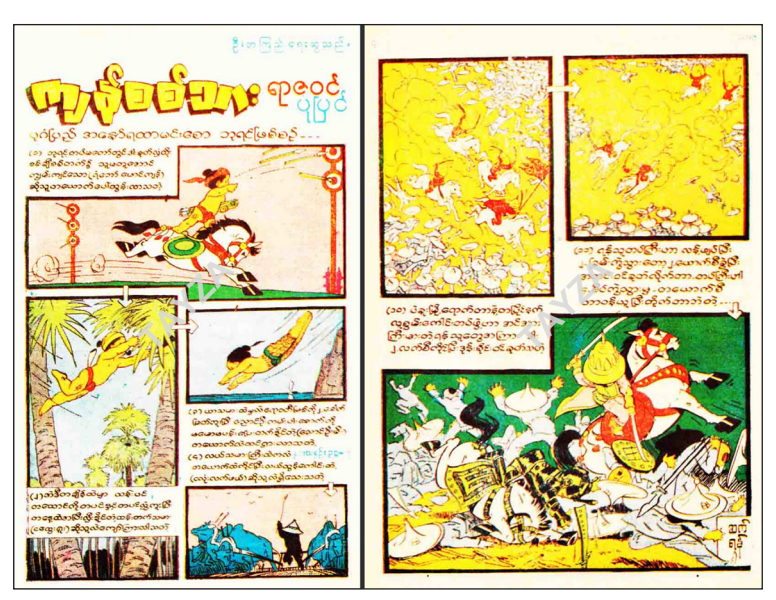
Figure 5: Two first pages of the adaptation of The Chronicle of the Four Paladins (U Ba Kyi 1965). Used with permission of U Ba Kyi's heirs.

The May 1968 issue of Tayza presents the final part of the first documented adaptation of a jataka tale by U Ba Kyi (see Figure 6). The four-page (and concluding) instalment retells the end of the 206th jataka tale, or Kurungamiga Jataka, in which the Bodhisattva is born as an antelope [or deer] and befriends a woodpecker and a tortoise. It shows the first documented use of speech and thought balloons in U Ba Kyi's work.6 Page compositions are highly creative as numerous panels have curved or oblique borders. The shape of the third panel of the penultimate page seems to echo the wavy dividers of Pagan painted strips. Plain flat colours are dominant in the background. Bright red flowers in the final panel might also evoke the use of floral motifs in traditional painting. Characters are expressive and lively; U Ba Kyi fully embraces and plays with the fablelike quality of this jataka. Most interesting is the character design of the hunter with over-developed lower legs and forearms. This trait is reminiscent of American comic strip character Popeye and it was also borrowed by Siamese artists Sawas Jutharop in 1932 and Wittamin in 1935 (Verstappen 2021:33-35, 38, 42). Along with the 1952 'pieeyed' design of Pyusawhti mentioned earlier, it is the only clear influence of a Western comics-related production on the 'cartoony' style of U Ba Kyi to be established.