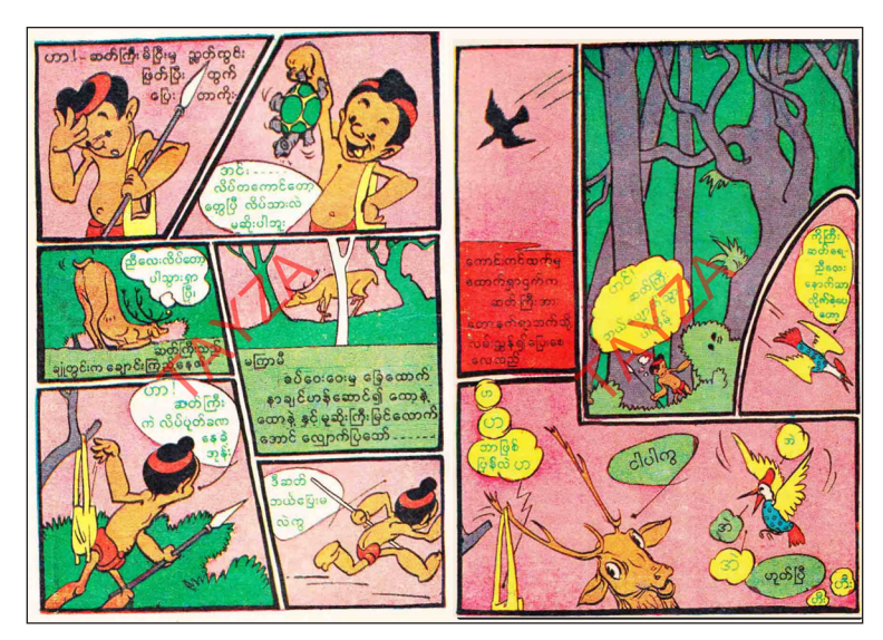
Figure 6: Pages from the adaptation of Kurungamiga Jataka (U Ba Kyi 1968). Used with permission of U Ba Kyi's heirs.