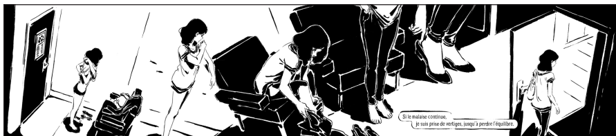
Figure 1: Marietta Ren, "Phallaina". © Marietta Ren and France Télévisions, 2016.

Malec, one of its fiercest supporters, clearly opposes printed and digital comics through the use of turbomedia: 'Turbomedia allows me to mix comics and animation. It's totally different from printed comics, there is no printed version of turbomedia. But if I was asked tomorrow to make a [printed] comic book, I